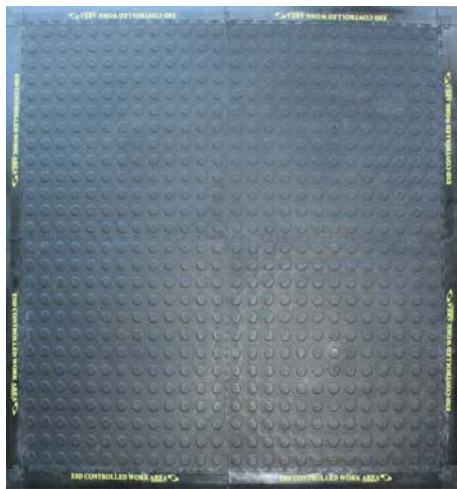
Conveniently Configured with Edging for Mats